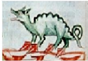
Tirol um 1375 Sammlung Wien